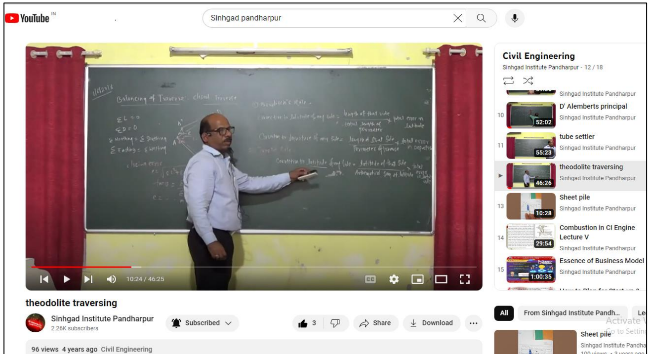
Figure 1: Sample YouTube lecture delivered by faculty member

Sample of you tube lecture delivered by staff are shown in figure 1 & figure 2 respectively.