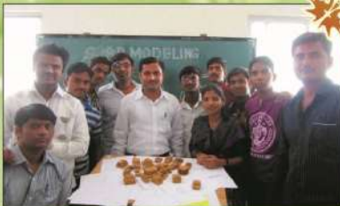
SOAP MODEL MAKING